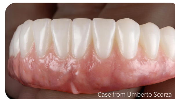
Case from Umberto Scorza