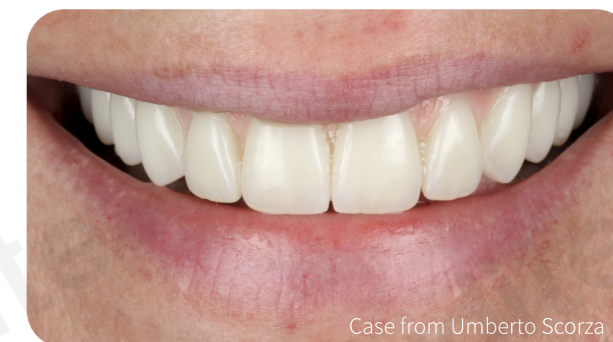
Case from Umberto Scorza